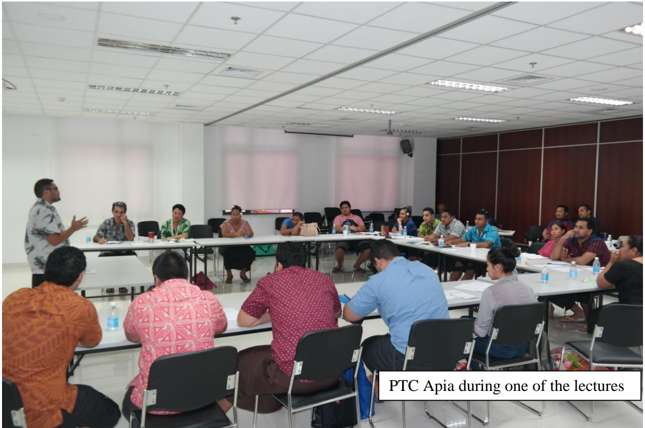
PTC Apia during one of the lectures