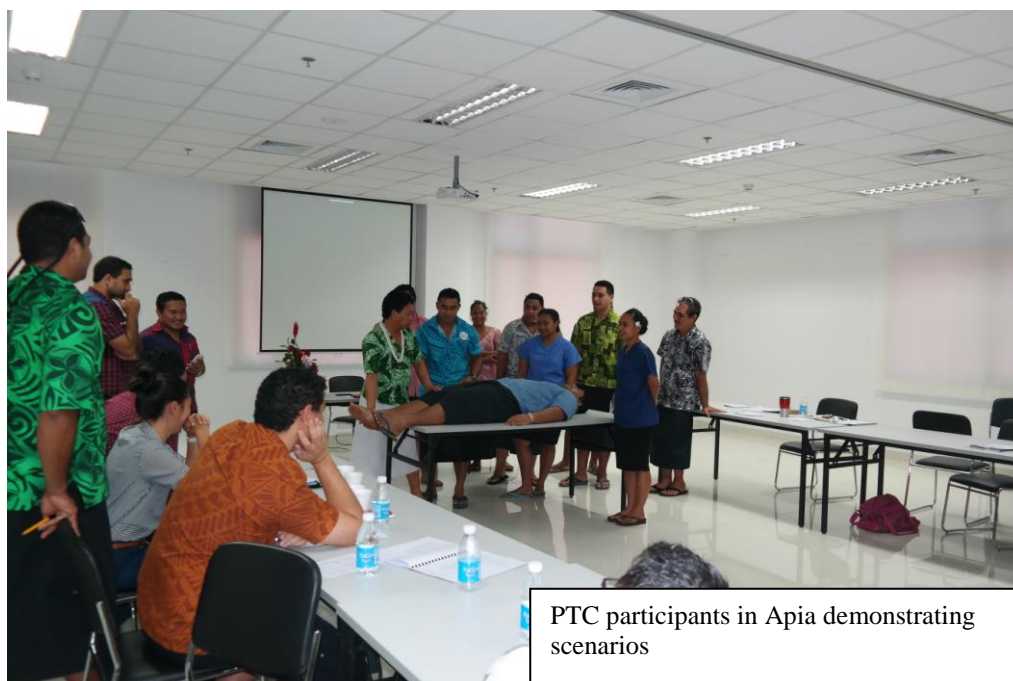
PTC participants in Apia demonstrating scenarios