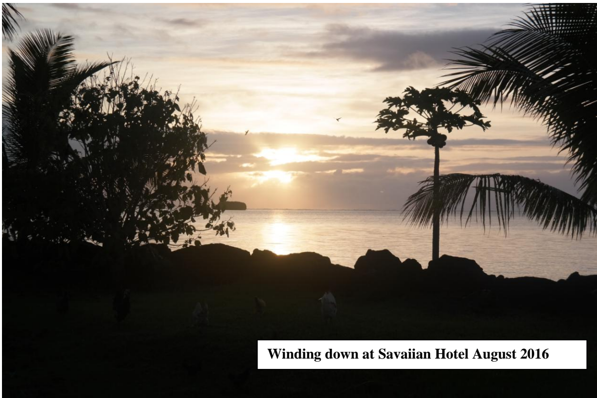
Winding down at Savaiian Hotel August 2016