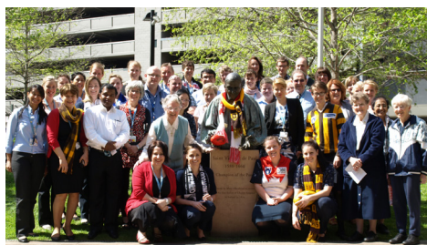
Photograph of staff group during Mission Week activities in 2012. Photographer unknown.

The Archives and Heritage Centre collects and preserves material that tells the story of St Vincent's and its people, from the hospital's foundation in 1893 to the present day. Some items are retained because of legislative requirements, and others because they support understanding of St Vincent's unique Mission, culture and achievements. Highlights of the collection include the hospital's earliest medical casebooks, nurse training registers, and photographs of hospital buildings and services through the years.