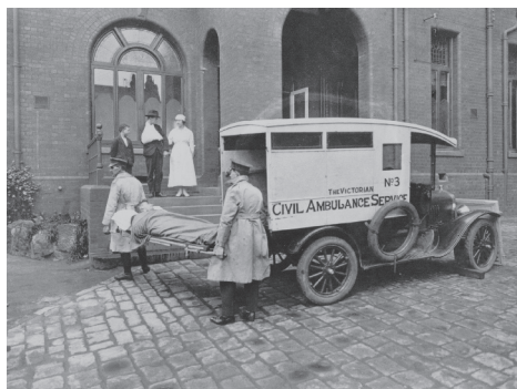
Ambulance arriving at the Casualty entrance c. 1925.

The Archives and Heritage Centre is open to St Vincent's staff, researchers and other interested members of the public. Please contact the Archivist before your visit to discuss your research interests and to arrange an appointment time.