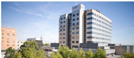
St Vincent's Fitzroy campus in 2012.

Brochure produced in Melbourne's centenary year publicizing the newly opened hospital wing on Victoria Parade (Healy Wing).