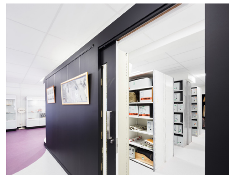
View of storage and display areas in the Centre.