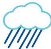
EMOTIONAL OR PSYCHOLOGICAL DISTRESS