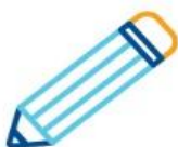
ISSUES WITH WORK OR STUDY