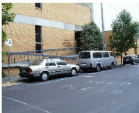
Disabled Parking on Regent St within 50m of Bolte Wing

There is also an undercover car park below the Inpatient Services building accessed via Fitzroy St. Charges apply.