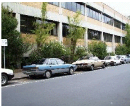
Disabled Parking on Princes St within 50m of Bolte Wing

Disabled parking spaces are also available in Princes Street, adjacent to the Bolte Wing and Regent St (which runs parallel to Nicholson St), next to the Inpatient Services Building.