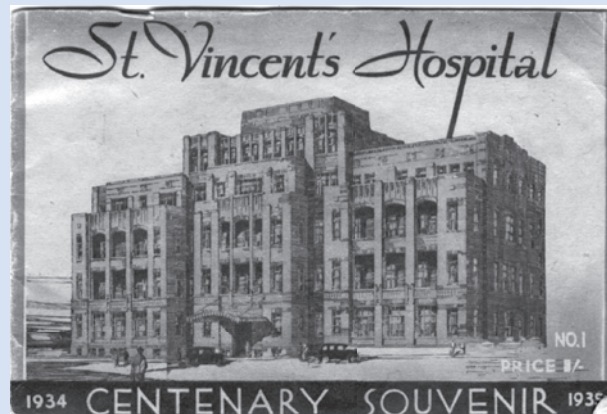
1935 brochure produced in Melbourne's centenary year about St Vincent's newly opened hospital wing (Healy Wing).

Access to some records may be restricted because of the physical condition of the materials or the private and confidential nature of the information they contain.