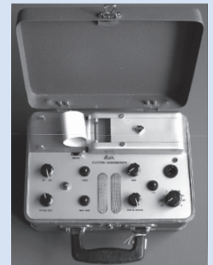
1960s era Both electrocardiograph (ECG) machine.