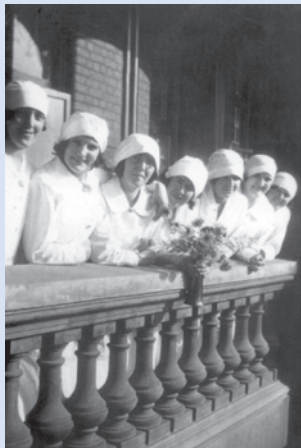
Photograph of nurse trainees 1929, King Collection.

The Archives support the understanding of the hospital's unique heritage, culture and achievements. They are a resource for the various educational and business activities of the hospital and are used by departments and staff celebrating milestones. They are also consulted by historians, researchers and other community members.